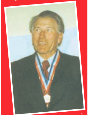
Alpine League Awards