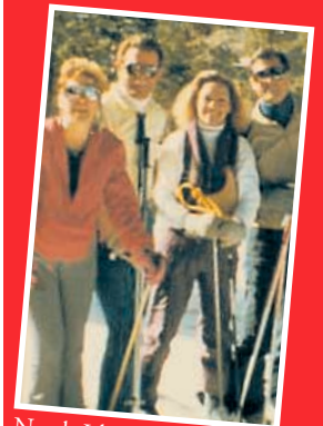
North Island @ Tahoe 1988