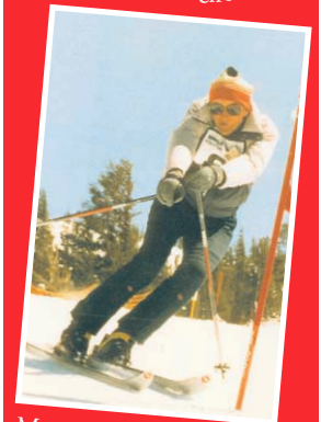
Mammoth Standard Race 1986