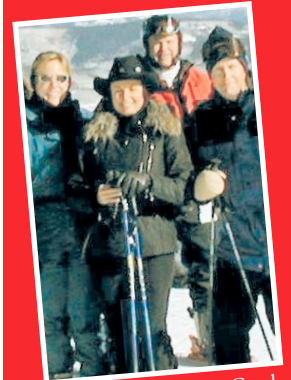
Action @ Beaver Creek 2003