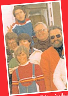
San Diego @ Sun Valley 1980