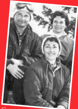
Convair @ Sun Valley, ID circa 1950s