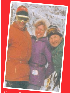
Torrey Pines @ Vail 1975