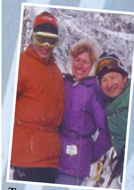
Torrey Pines @ Vail 1975