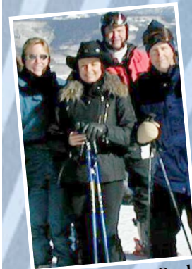
Action @ Beaver Creek 2003