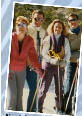
North Island @ Tahoe 1988