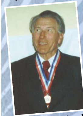
Alpine League Awards