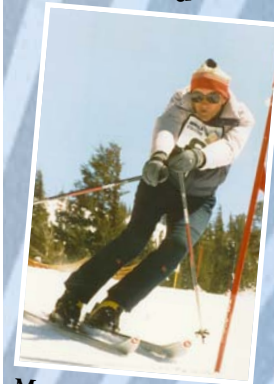
Mammoth Standard Race 1986