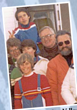
San Diego @ Sun Valley 1980