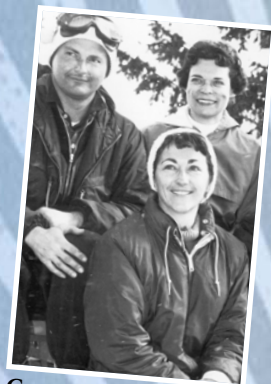
Convair @ Sun Valley, ID circa 1950s