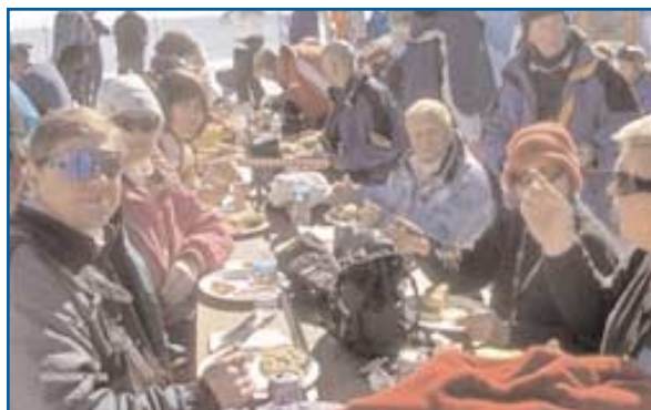
Tri Valley at Mountain Picnic

Privately owned businesses support the town of Telluride. There is no McDonalds or Wal-Mart here. Telluride has the only publicly funded gondola in the USA. It is free to ride. *