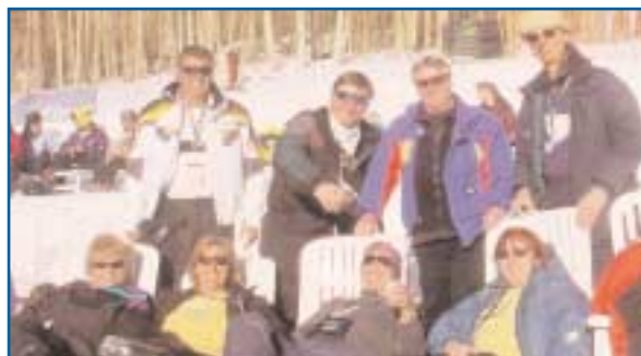
Lunch Sun Bathers