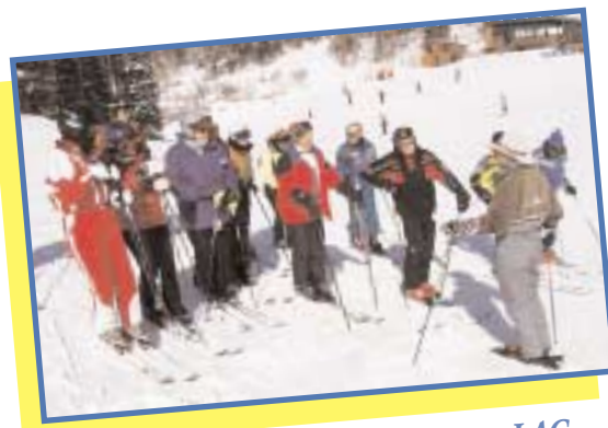
Billy Kidd Gives Racing Tips to LAC