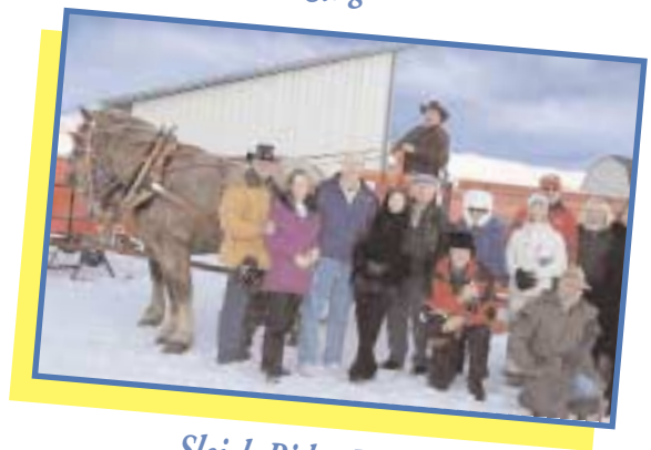
Sleigh Rider Diners